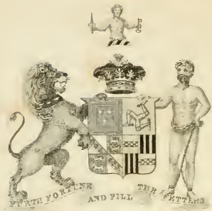
Murray, Duke of Atholl.