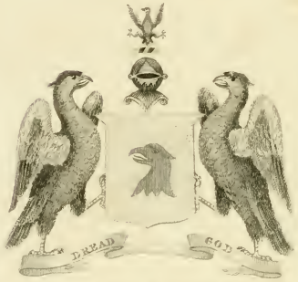
Messrs. of Foulis.