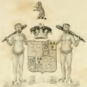
Duke of Sutherland.