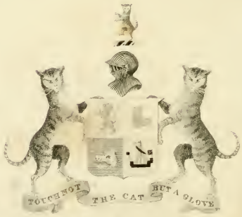
Mackintosh of that ilk.