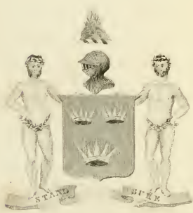
Grant of that ilk.