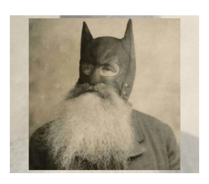
Vintage Pic of a Bearded, Masked Man Inspired 'Batman'?