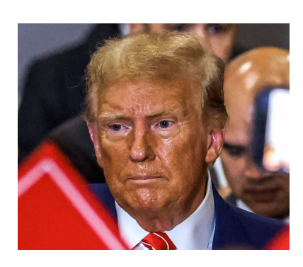
Real or Fake: Is This an Authentic Photo of Trump?