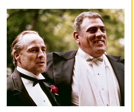
Mafia Was Involved in Making of 'The Godfather'?